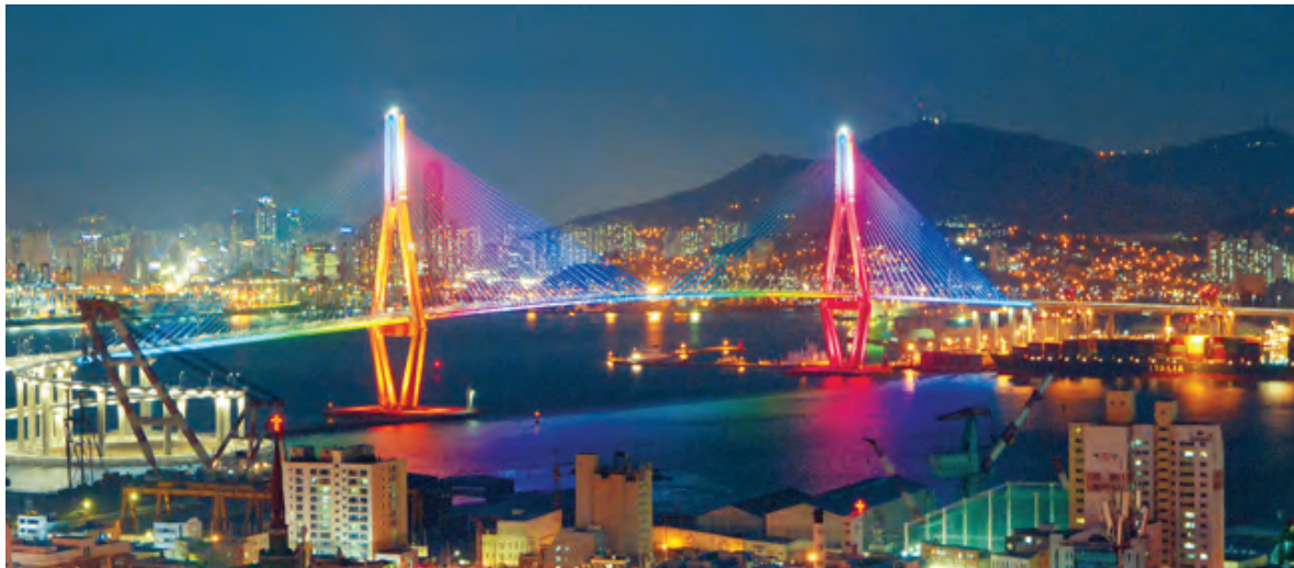
Busan Port Bridge lit up beautifully page 4